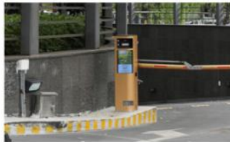
Automotive and Transportation