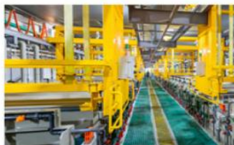
Product Line Management