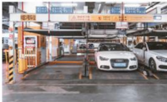
Parking lot Management