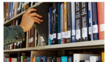
Library Book Management